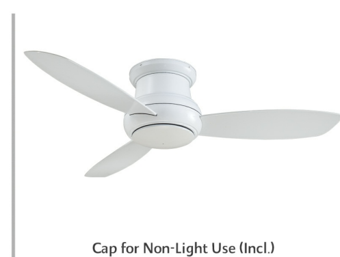
Cap for Non-Light Use (Incl.)