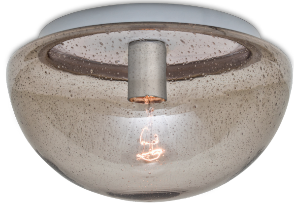
8490SMC Smoke Bubble

UL wet location when used under a covered ceiling.