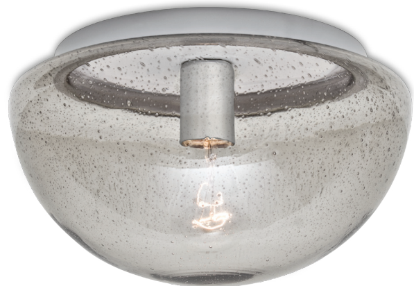
8490CLC Clear Bubble